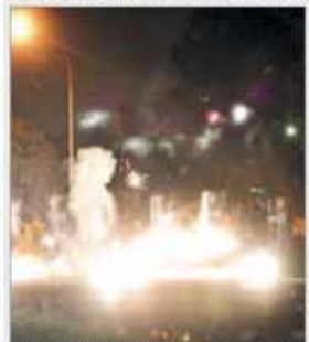
Protesters explode at the feet of riot police last night.