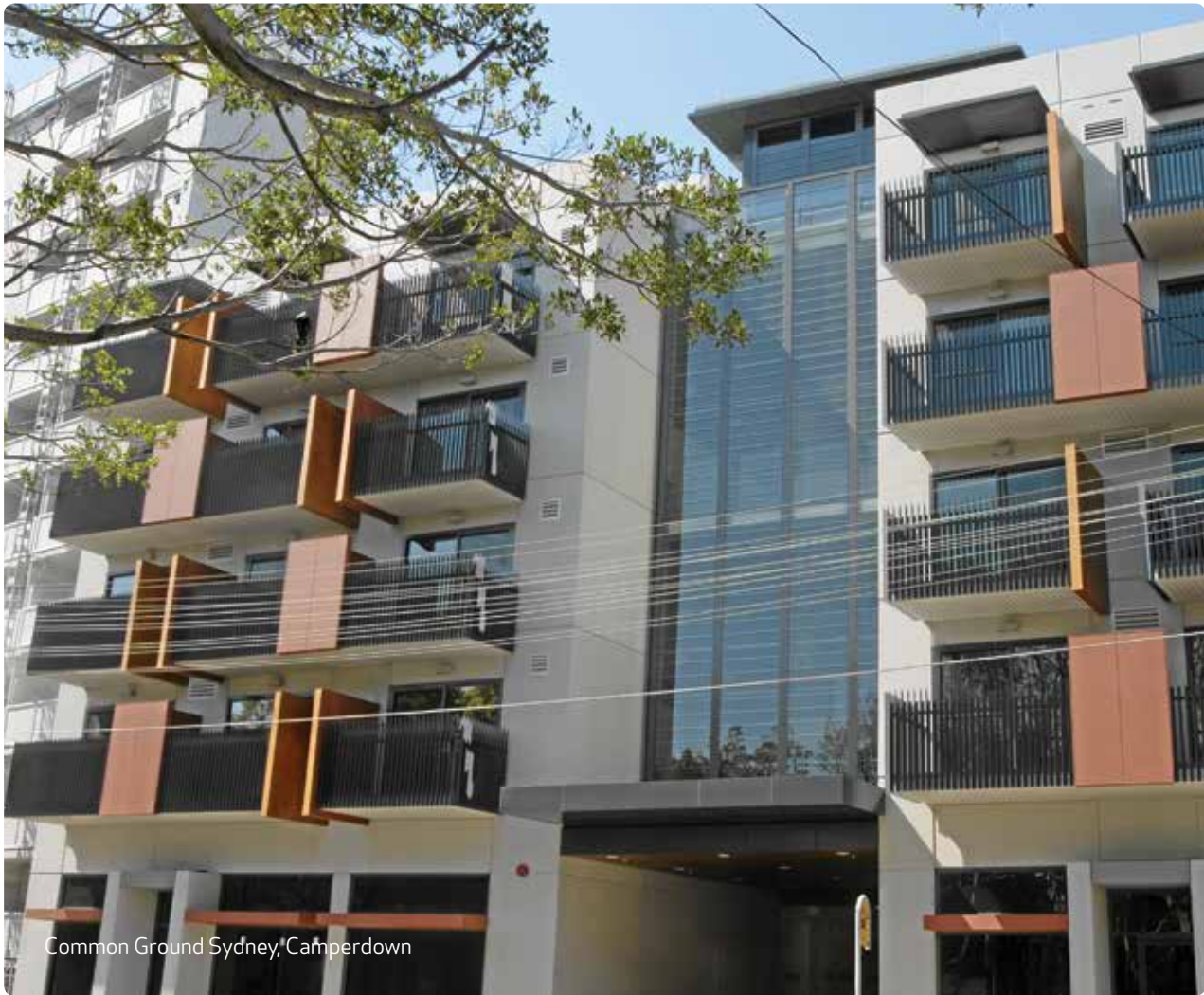
Common Ground Sydney, Camperdown