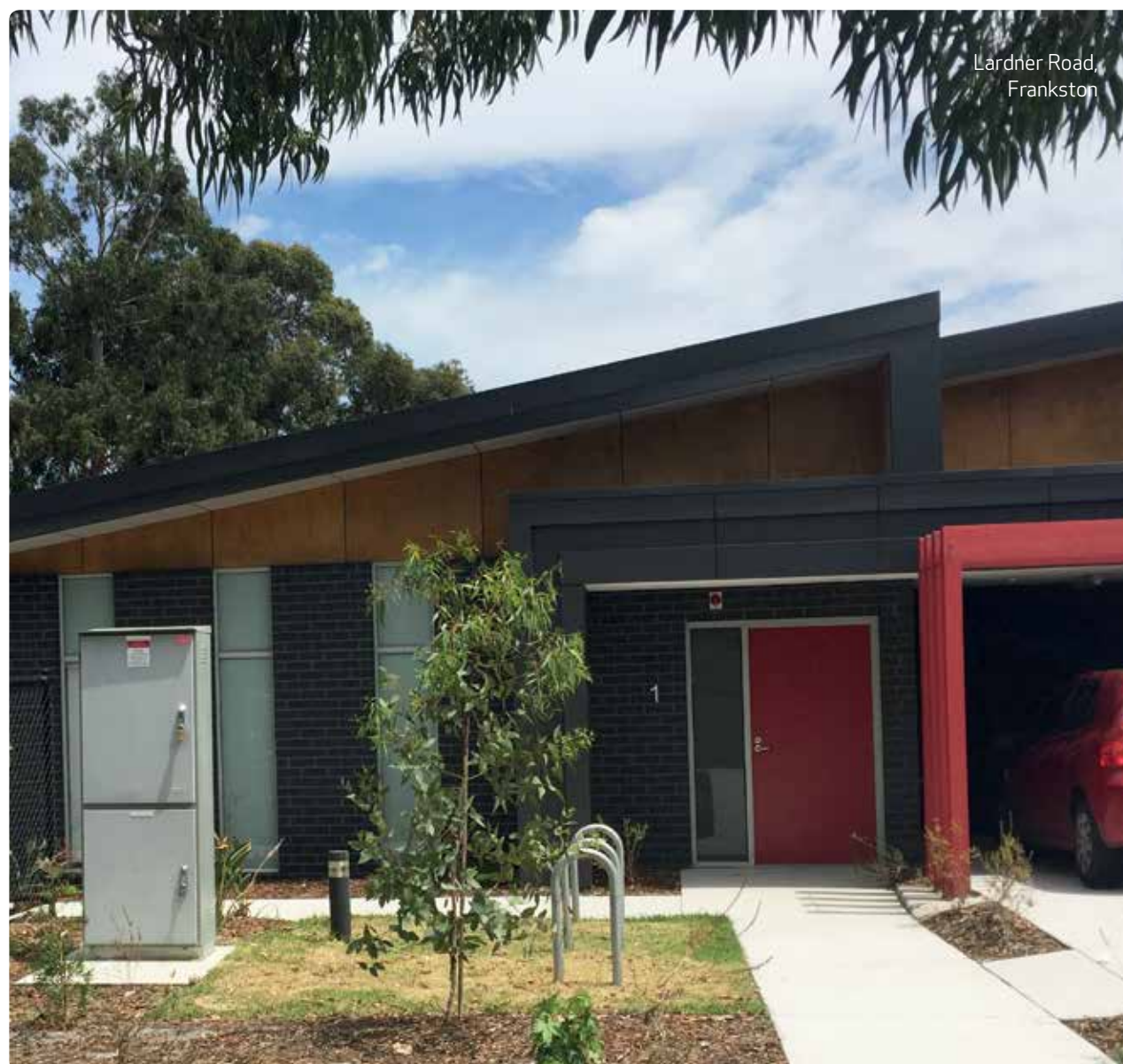
Lardner Road, Frankston