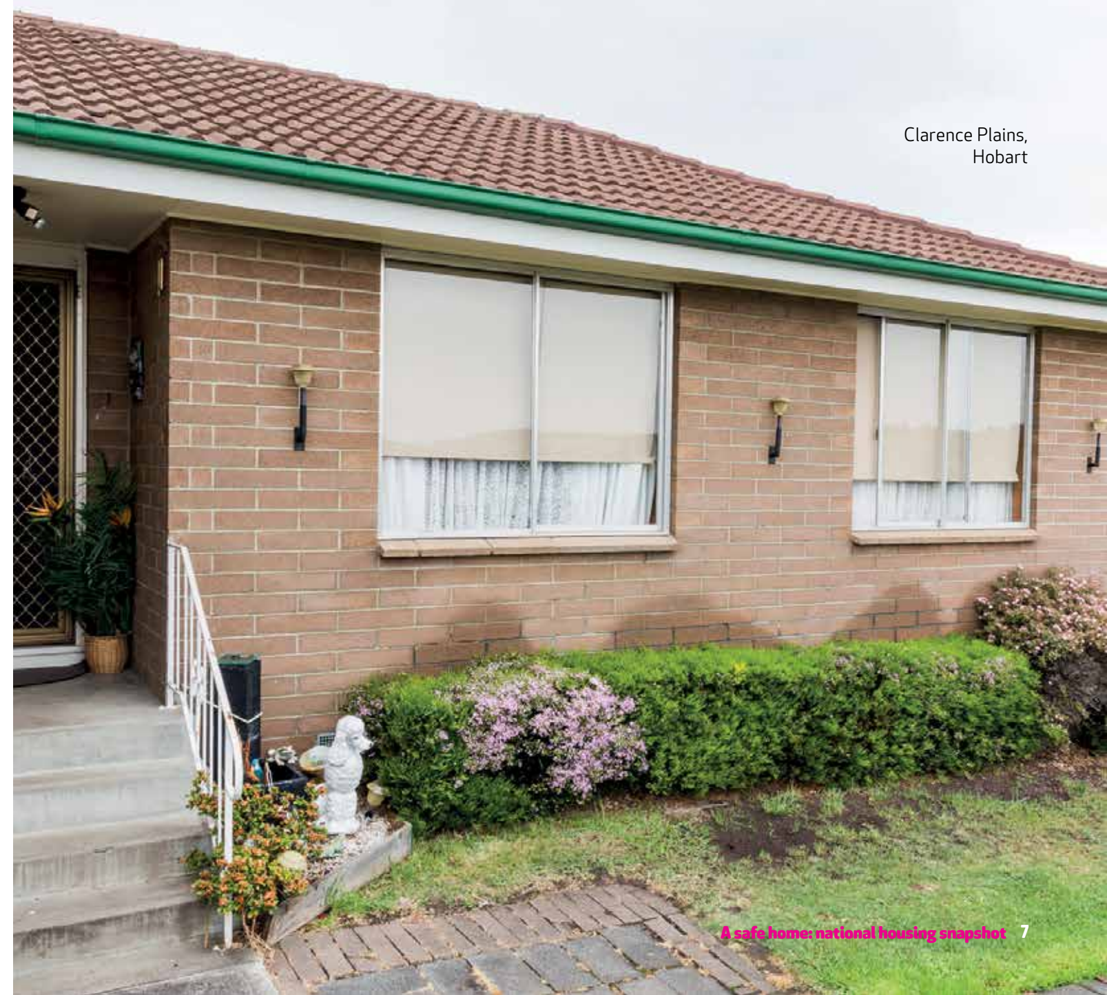
Clarence Plains, Hobart