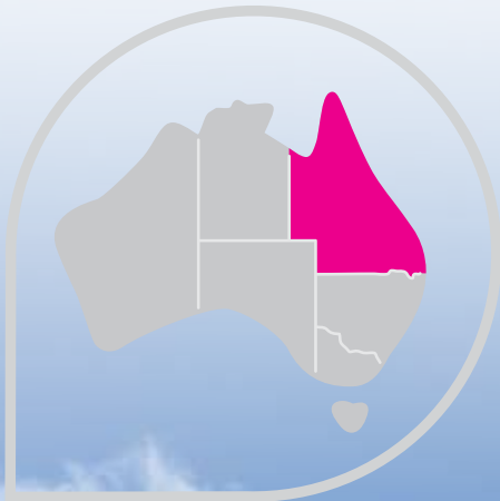
Woree Supported Accommodation, Cairns

The success of this facility saw the development and construction of a second stage facility in Cairns that opened in June 2016. Woree Supported Accommodation is an 18 unit complex of fully self-contained units providing medium term supported housing to people transitioning back in to social and affordable housing markets.