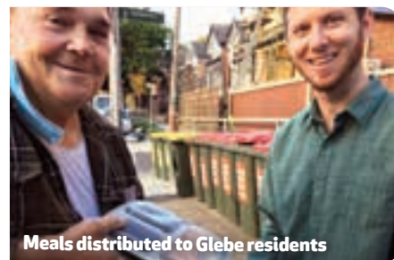
Meals distributed to Glebe residents