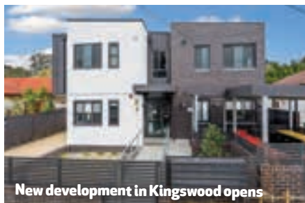
New development in Kingswood opens